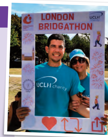
Thanks to all our walkers this year- check out our next edition to see how much we've raised.