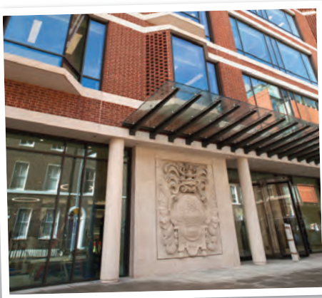
New Royal National ENT and Eastman Dental Hospitals