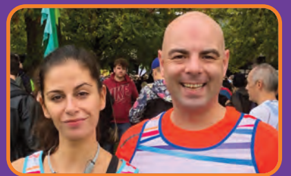
Royal Park runners

Thank you to our runners and supporters who turned out on a very soggy Sunday for the Royal Parks Half Marathon in October. In contrast to the rain and mud, the atmosphere was cheery and our runners did us proud! The Royal Parks Half is a beautiful run through London's green spaces and iconic landmarks. If you'd like to take on a challenge for UCLH Charity, talk to our fundraising team on 020 3447 9361.