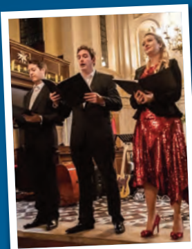
The 2018 carol concert

THURSDAY 19 DECEMBER, 6.15 PRE RECEPTION, 7PM START, ST GILES-IN-THE-FIELD, LONDON WC2H 8LG