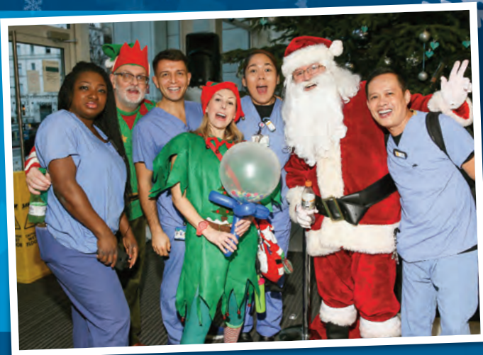
Festive fun at last year's event

Every year 4,000 santas descend on Victoria Park in east London for the famous Santa Dash. You could be one of them! Choose from a 5km or 10km distance to take part and raise a minimum of £100.00 for UCLH Charity. Email: uclh.enquiry.charity@nhs.net