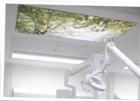
UCLH Charity funded this ceiling light

Two international centres of excellence - the Royal National Ear, Nose and Throat Hospital and the Eastman Dental Hospital - have come together to create a hub for care, treatment and research into head, neck, ear, nose, throat, dental and oral conditions. Charitable donations have helped to enhance this stunning new facility, making it the very best it can be. Items funded by philanthropy include: