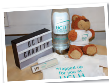
Last year's Christmas presents

The holiday season also provides a rare opportunity for staff to get together. We provide a small grant for