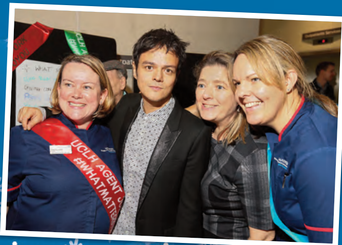
Last year's special guest Jamie Cullum with UCLH nursing staff

Join us at the annual festive open event where you'll also be able to enjoy music from Camden Voices and Concordia Foundation, participate in creative art making and grab a mince pie before seeing the Christmas lights being switched on by a very special guest. There will also be the opportunity to support UCLH Charity by buying our Christmas cards, writing a reflective heart and seeing what we've got planned for 2020. There's no need to book, just turn up on the day.